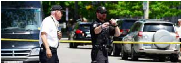
Traffic Safety results from “Operation Impact”

Ottawa Police traffic units will continue with these types of initiatives, focusing on various traffic enforcement themes.